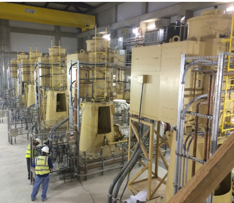
Five large vertical pumps from Sulzer's SJT range were manufactured for the project

Realizing the installation could face some major challenges, Sulzer involved the field service team during the order engineering process to minimize these challenges during the installation.